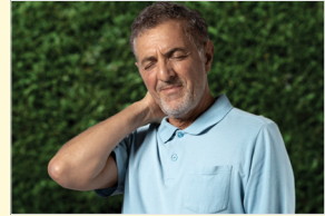
Feeling tired, fatigued