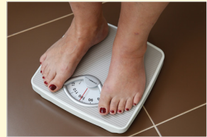
Rapid weight gain